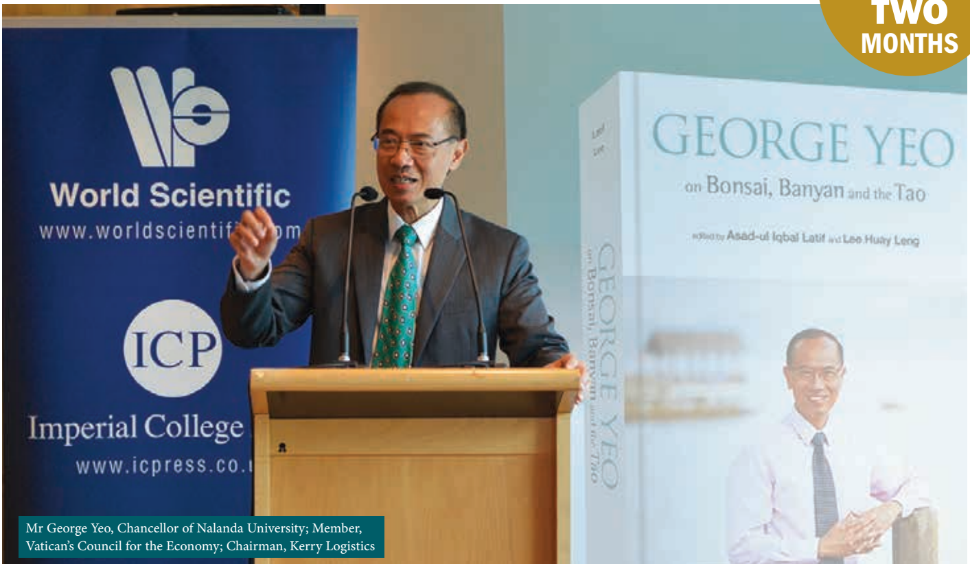
Mr George Yeo, Chancellor of Nalanda University; Member, Vatican's Council for the Economy; Chairman, Kerry Logistics

World Scientific was proud to release a book on the former Foreign Affairs Minister George Yeo, titled “George Yeo on Bonsai, Banyan and the Tao”, in May. The book was made available in major bookstores and has proven to be a bestseller.