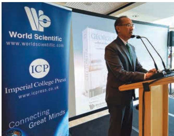
Mr George Yeo giving a rationale for the book title “Bonsai, Banyan and the Tao”.

The English version was launched on July 9 at the Esplanade in Singapore, itself a major project initiated by Mr Yeo as a former minister of the Ministry of Information and the Arts. The event, held at the main concert hall foyer, was graced by Nobel laureate Amartya Sen with 600 guests in attendance.