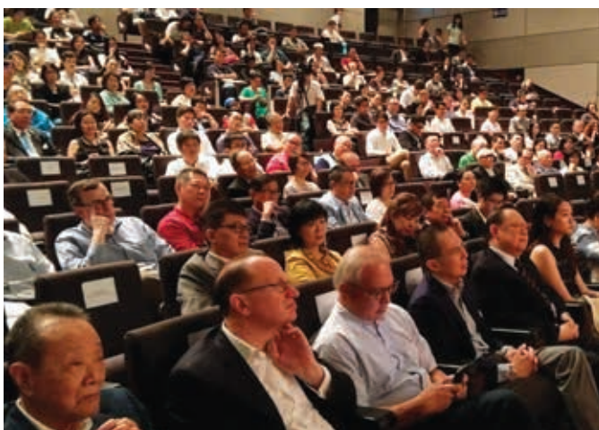
Present at the launch were Robert Kuok (first from bottom left), 錢果豐 (third) and Richard Li (fourth).