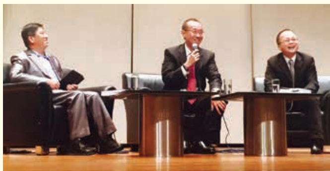
At a panel discussion during the book launch in Hong Kong.