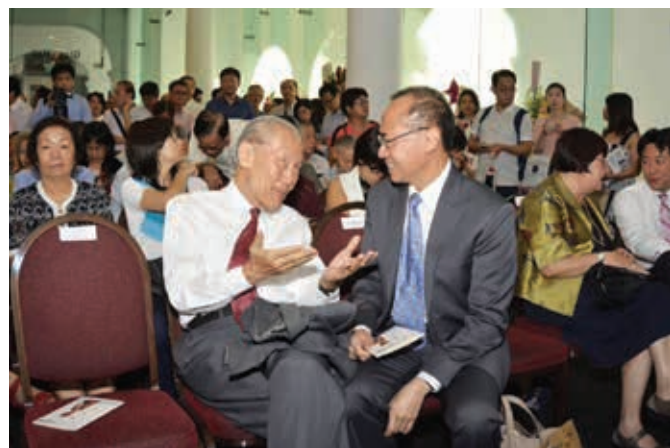
Prof Wang Gungwu chatting with Mr George Yeo before the Chinese book launch at the Singapore Art Museum

Upon his return to Singapore, he launched the simplified Chinese version at the Singapore Art Museum, site of the original St Joseph’s Institution, his alma mater on 22 July. Professor Wang Gungwu was the guest of honour at the launch which attracted a crowd of 300, comprising members and leaders from various clans and associations like the Singapore-China Business Association, People’s Association, Tan Kah Kee, International Society and Foundation, Chui Huay Lim Club, Ngee Ann Kongsi, Federation of Chinese School Alumni Associations, Teochew Federation, Yangzheng Alumni, Hwa Chong Alumni, amongst others.