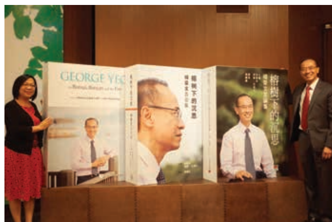
Both Mr and Mrs George Yeo launching the book in Taipei