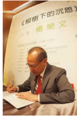
Mr George Yeo, signing the book of a participant at the Eslite Bookstore.

who gave speeches during the event, including Mr. Vincent Siew, the former Vice President, and Mr. Eric Chu, New Taipei Mayor and KMT Chairman.