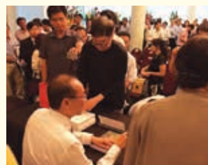
Mr George Yeo signing books at the launch of the Chinese version at Singapore Art Museum.