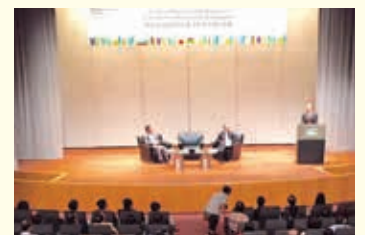
Launching his book at the Hong Kong Convention and Exhibition Centre.